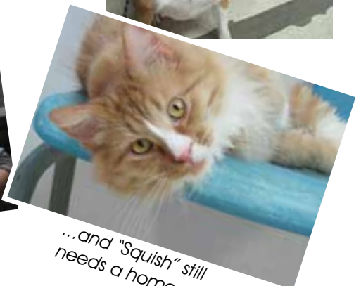
...and "Squish" still needs a home