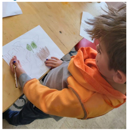
The students at Evergreen Kids Corner, Hamilton took their humane education class seriously as they visited the BRHA pets on our website and then chose one to draw.....what budding artists! Learning about animal welfare, at such a young age, will truly be a benefit to our community's pets in the years to come....Thank You for caring!