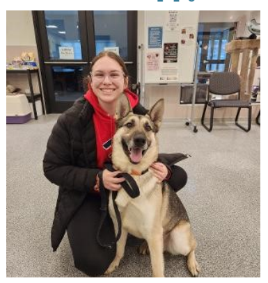
Thank You for adopting!