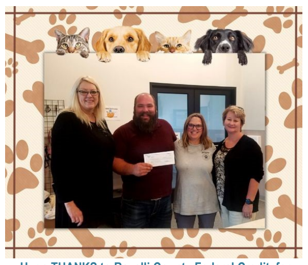
Huge THANKS to Ravalli County Federal Credit for their $3,000 donation from their recent BRHA fundraising event! Your generous caring will help us create a new exercise & play area at the front of our property for our canine guests!