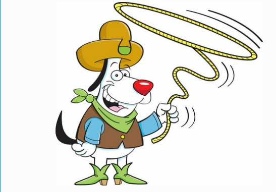
Murdoch's ROUND UP AT THE REGISTER

For March & April, round to the nearest dollar of your purchase to support BRHA! Be sure to ask!