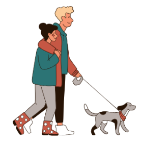
Dog Walking and Socializing