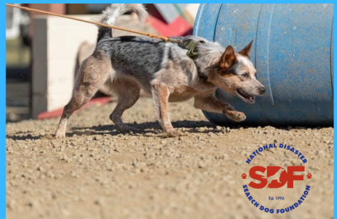
“Ruffles” hard at work training for her new job!