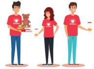
Events and Fundraising