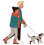
Dog Walking and Socializing